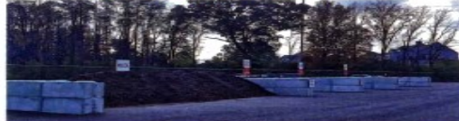
(From LEFT to RIGHT) 1) Mulch 2) Garden Residue 3) Leaves 4) Brush