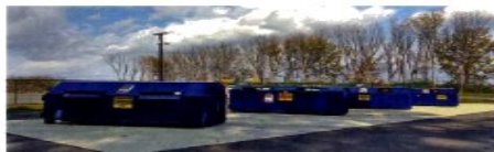
Drop-Off Recycling Center outside the fence.